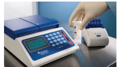
3. Enter patient ID