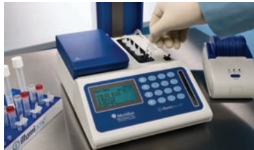
1. Load samples